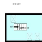
Made with Mergin ©2025